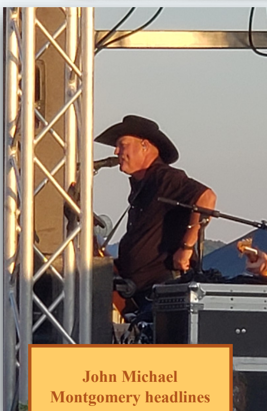
John Michael Montgomery headlines for the 2019 Mudtown Days Concert Series