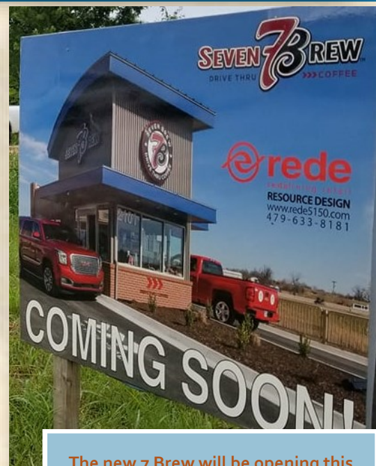
The new 7 Brew will be opening this Fall in Lowell. 7 Brew is located near the intersection of J.B. Hunt Corporate Drive & South Bloomington.