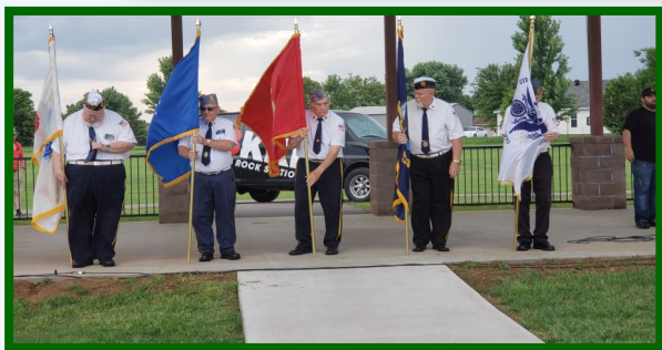
American Legion Post 100—Opening Ceremony