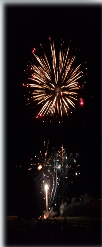
Fireworks were a great way to close out the 43rd Annual Mudtown Days Event for 2019