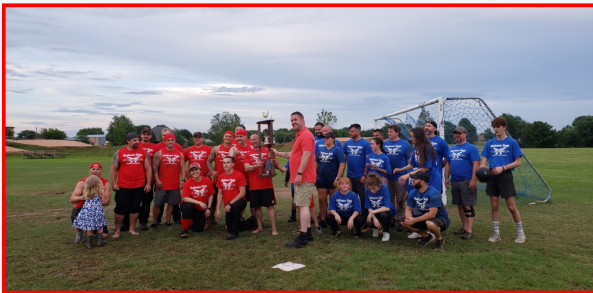
Guns & Hoses Kickball Tournament between Police and Fire Departments.