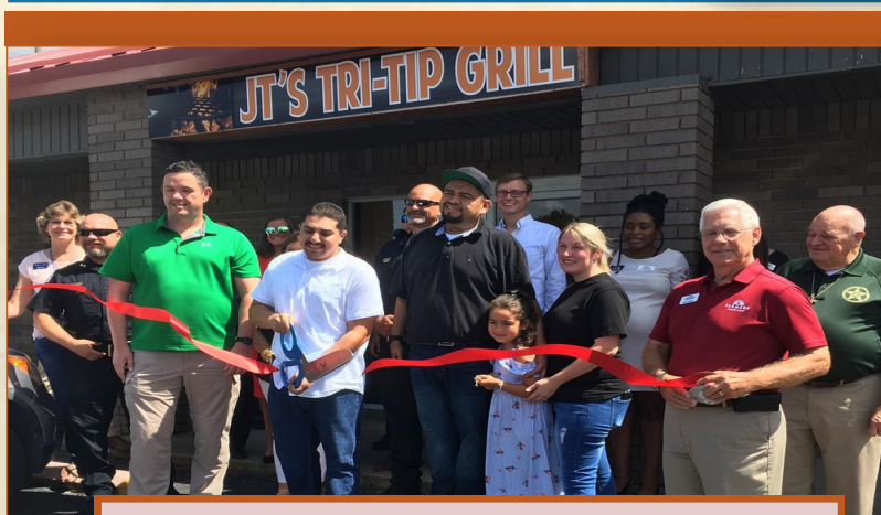
JT'S Tri-Tip Grill Ribbon Cutting in June. JT'S is located in LA Plaza at 320 N. Bloomington