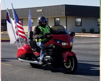
Veterans Day Parade on a very cold day! Thanks to everyone that made this parade possible!